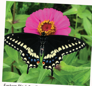
Eastern Black Swallowtail – Courtesy Renee Rule

Garfield Park Arts Center 2432 Conservatory Rd.