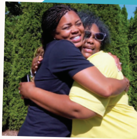
Loving Life Productions, LLC and the Pettiford-Weaver Family

Reception at 6pm, film screening at 6:30pm.