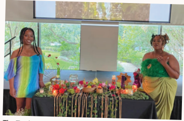
The Testimony Service

Doors open at 4pm; programming starts at 5pm.