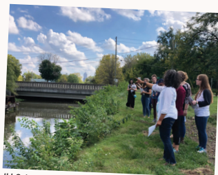
IU School of Liberal Arts Museum Studies Program at IUPUI

Broad Ripple Park Family Center 1426 Broad Ripple Ave.