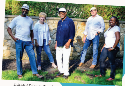
Faithful Friends Band

New Joy Lutheran Church Main Sanctuary 316 W. 156th St., Westfield ASL interpreted